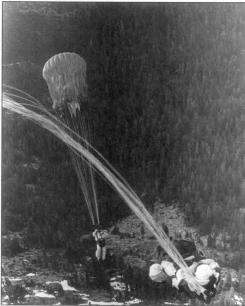
Early season fire jump in R-5 Marble Mountains Wildermess Area.

The Forest Service had several projects that kept the jumpers busy when they were not fighting fires. Current Forest Service policy is to develop snags for bird habitat. The jumpers either girdle to bore holes in the trees so that the tree will die, creating a snag that birds can use for nesting. The policy requires a certain number of trees per acre and there are thousands of such trees throughout the forest.